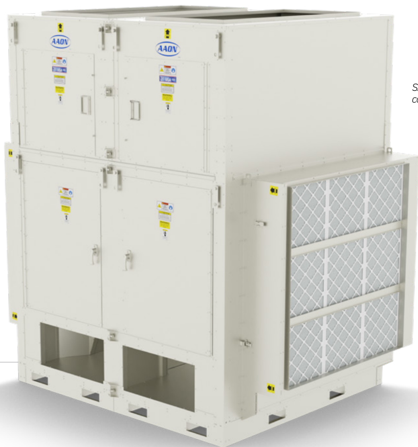
SA water-source heat pump double configuration for large capacity applications.

SB Series units (B cabinet) are designed to fit through standard 36-inch wide by 80-inch tall doors for ease of installation and retrofit applications. C and D cabinets can be shipped from the factory in a split configuration to fit through a standard door opening. SB Series units can be shipped from the factory with a forklift capable base to further ease installation unit run time.