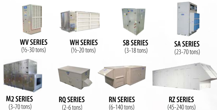
WV SERIES (1/2-30 tons)