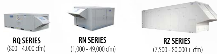
RQ SERIES (800 - 4,000 cfm)