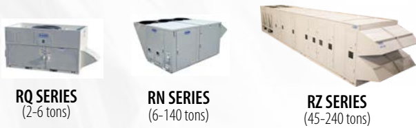
RQ SERIES (2-6 tons)