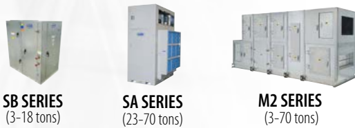
SB SERIES (3-18 tons)