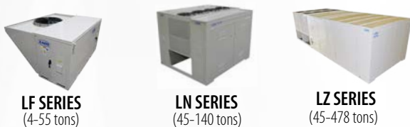
LF SERIES (4-55 tons)