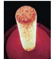
Ceramic Radiant Burner