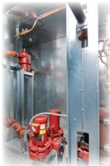
Factory Installed Boiler Building Pump