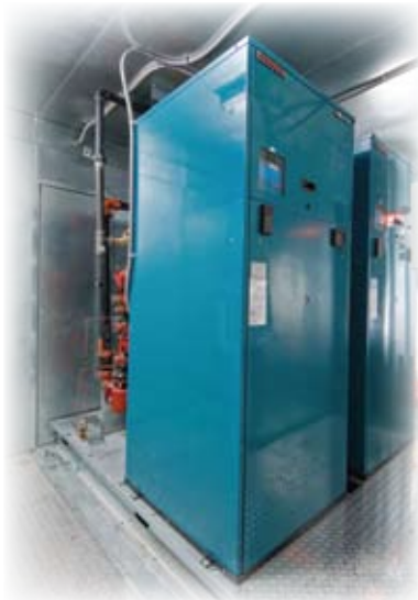
Factory Installed Boiler