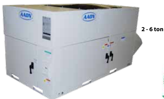
2 - 6 ton