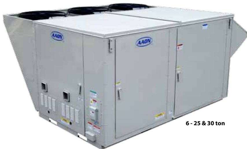
6 - 25 & 30 ton