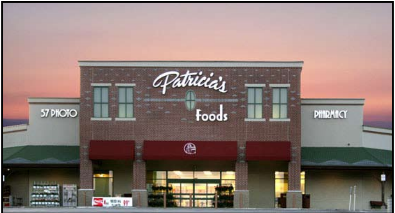
Patricia's Foods - Odessa, MO